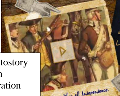
The American War of Independence.

August 1812 Once again, peace has disappeared and we will enter yet another war. Tensions between Britain and America have heated up and they cannot get along for many reasons. It has been rumored that the British have even been taking Americans against their will and making them work in the British