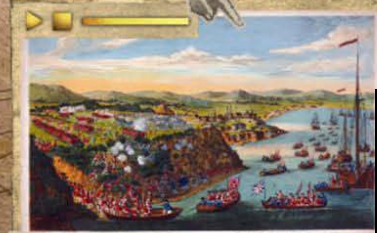
The British landing for their first attack.

February 11, 1763 More bad news has come, France has given up on us, they have abandoned New France. The British king, the Spanish king and ours signed a treaty